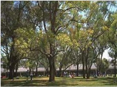
Bush Court, Murdoch Campus

The Australian Centre for Necrotrophic Fungal Pathogens and the Separation Science Laboratory at Murdoch University, Perth, Australia are current leaders in the emerging field of fungal metabolomics. We are seeking suitably qualified students to foster their studies in this exciting field. Applicants are particularly encouraged with the following strengths;